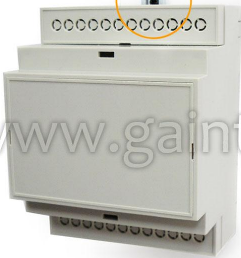
ON THE WALL

RECOMMENDED SCREW M2.6X10mm(OR LONGER) PAN HEAD