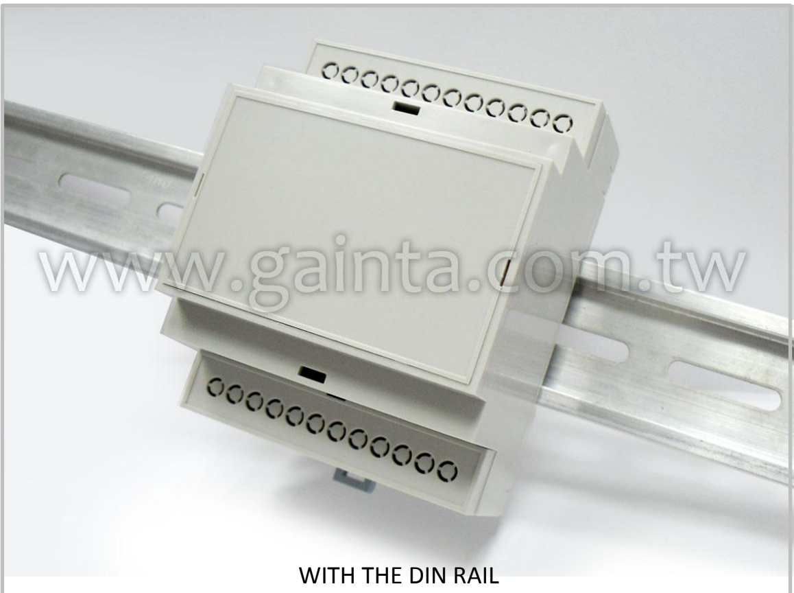
WITH THE DIN RAIL